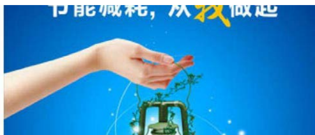
Figure 2 Green eco-protection posters produced by a public welfare organisation

Man is an important carrier to realize the construction and development of green economy of ecological economy, especially people's ideology and development idea are the key to realize the green ecological development of the existing economy in our country, and its execution ability determines the degree of economic development and the direction of the development of market economy, ecological economy and green economy. Therefore, we must establish a healthy green concept and ecological protection concept from the country to the people, and improve people's recognition of ecological economy and green economy from the ideological point of view. As shown in Figure 2: