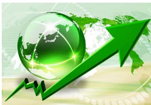
Figure 3 Green industry

The society is the whole of people's living environment, life concept and policy and law, and there are many factors involved in the communication and connection between policy and law and enterprise, which are especially easy to be restricted by the environment and people's consumption concept, and also the resistance to the implementation of relevant laws and regulations and policies. This has greatly limited the rapid development of ecological economy and green economy in China [5]. Therefore, government departments should strengthen the laws and regulations related to the development of ecological economy and green economy, and make rational formulation and continuous improvement of policies, and establish scientific supervision and management mechanism and supervision policy, and urge people to strictly implement and implement these laws and regulations and policies, so as to act according to law and abide by the law, for example, in environmental protection and new energy development and utilization, we must achieve timely accountability, effective accountability and vigorously promote the construction of green industry chain.